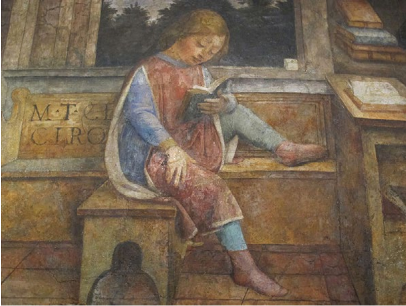
Fig. 1 V. Foppa, The Young Cicero Reading , c.1464.