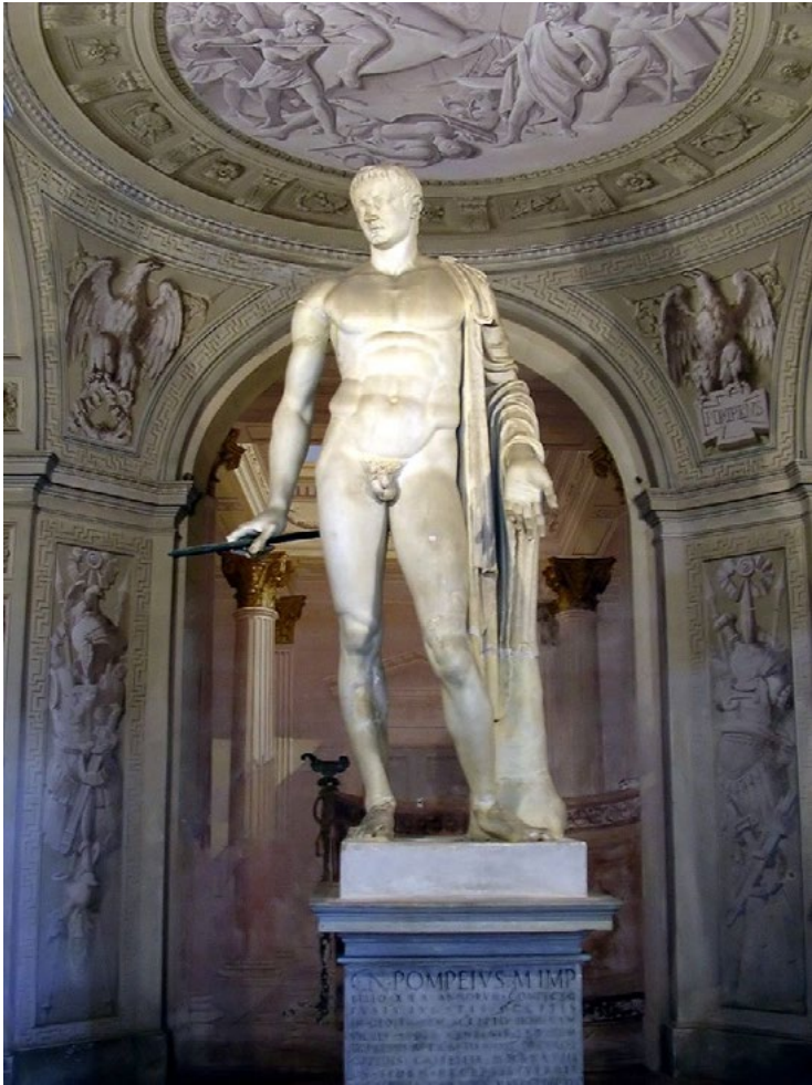
Fig. 2 Roman statue of Pompey , in Villa Arconati a Castellazzo di Bollate (Milan).