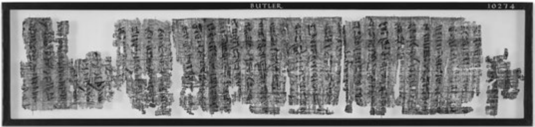
Fig. 1 The Tale of the Eloquent Peasant .

two more significant features. Firstly, in a historicist mode, the text demonstrates metafictional tropes well before the first millennium. The text knowingly plays with its own constitution, depicting acts of inscription from phōnos (speech) to logos (written text). Indeed, the self-referential framework at play in this text demonstrates that metafiction is a conceit as old as literature itself, as others have already suggested. 1 Even if I haven't begun here with the more well-known and likely contemporaneous Epic of Gilgamesh , the historical placement of the Tale of the Eloquent Peasant within the First Intermediate Period gives a starting point for metafiction that defies more recent attempts to situate the form most prominently within a postmodern movement harking back to romanticism. 2 Secondly, in a broader sense, the story focuses on a self-educated and eloquent subject from an outsider class. In the social strata of its time, peasants were not supposed to demonstrate learning through fluent and coherent speech (eloquence). This tale, then, stages a set of complex interactions between class and education, learning and refined talent but also, through its metafictional nature, between what we might see as social/literary 'genre' (codified social/literary/class expectations) and canon (birth right).