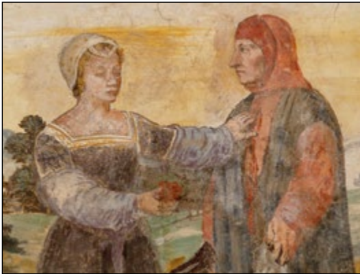
Petrarch and Laura. Fresco in Petrarch's house in Arquà Petrarca. 75

Like his predecessors, Petrarch does not write of love for a woman. He writes of passion incited by an object in female form, whose embodied reality he is all too ready to transform into a living goddess.