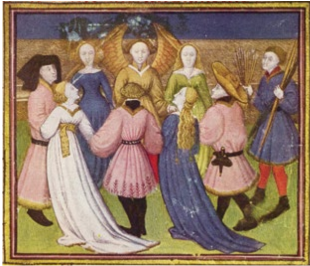
Meister des Rosenromans, Dancing before the genius of love, in Roman de la Rose (ca. 1420–1430). 88

Writers often use their villains to assert certain inconvenient truths. Milton does this with his Satan; Shakespeare does this with his Edmund, and Guillaume de Lorris and Jean de Meun do this with a number of their characters. What can be confusing about the the Roman , however, is the fact that criticisms about a wide variety of things come from every character and even from the narration; the reader is left to decide what is “trifling” and what is truth. One common thread is hypocrisy, which is underscored in both sections of the poem, and often revisited directly or indirectly. Lover walks through the garden and sees a wall covered with images. He describes each one carefully, and when he gets to the image of Hypocrisy ( Papelardie ), he gives a particularly cutting description: