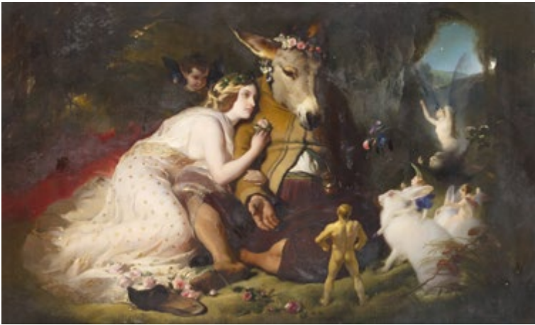
Edwin Henry Landseer, Scene from A Midsummer Night's Dream. Titania and Bottom (1848–1851). 110

The relation of judgment to the eyes, seeing, sight, and insight, and their association with love are the dominant themes of the mix of magic and comedy that plays out in the forest scenes in the middle of the play. It is through the eyes, manipulated with herbal magic, that love is changed, conjured out of nothing, and (for some) restored. The comic action suggests both the fragility and the power of love, the ease with which surfaces can be mistaken for depths, especially for the young men of the play—though even the fairy queen Titania finds herself “enamored of an ass”. 109