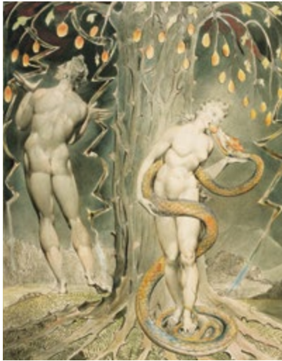
William Blake, The Temptation and Fall of Eve . Illustration to Milton's Paradise Lost (1808). 10

It should be noted that Adam thinks this inwardly , relating none of this to Eve herself. Until this point, he is with the critics whose orthodox frames of reference lead them to perceive disobedience as the great original sin that led, once upon a time, to the mixed human condition of joy and pain, life and loss, hope and despair that is the definition of “fallen”.