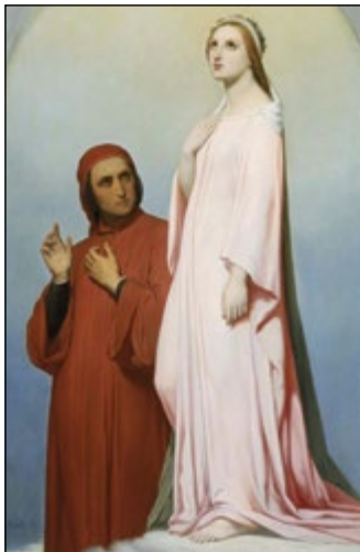
Ary Scheffer, Dante and Beatrice (1851). Museum of Fine Arts, Boston. 56

Here again, love for the "woman" is not love of a human being, but worship of an angel, and a conduit for salvation: "Beatrice gradually becomes a bearer not only of health and of salutation [...] but of salvation. Dante's overwhelming experience of love [...] for Beatrice becomes transformed into a sacred spiritual force". 55