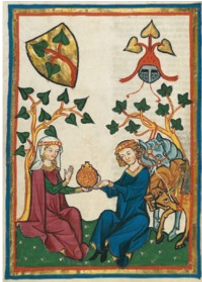
Codex Manesse , UB Heidelberg, Cod. Pal. germ. 848, fol. 314v Herr Günther von dem Vorste (between 1305 and 1315). 205

It becomes a sacrament of the church, controlled by religion, government, and God. 206 As Matthew 19:6, written during the height of the Roman Imperial era, puts it, “What, therefore, God has joined together, let no man tear apart”. 207 Where is the choice for those who are married? In the dawn songs like En un vergier sotz fuella d’albespi , and Den morgenblic bî wahtaeres sange erkôs , we see the awareness that there can be a choice. 208 But the awareness is painful because it comes with the knowledge of