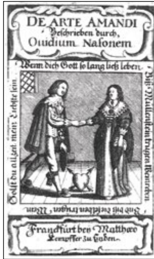
Title page of a 1644 edition of Ovid's Ars Amatoria . 77

banishment. Rather than passion sublimated into a search for the divine, these poems are perhaps our first clear example, unsullied by the allegorizing and temporizing mood, of what the troubadours will call fin'amor , love as an end in itself.