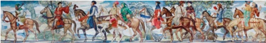
Canterbury Tales mural by Ezra Winter (1939). North Reading Room, west wall, Library of Congress John Adams Building, Washington. 190

By the late fourteenth century in England, things are beginning to change. Geoffrey Chaucer was by that time certainly aware of the approach to love that would later be described by scholars as “courtly”. His works often parody this attitude, and in the Canterbury Tales , Chaucer provides rich soil for just such a parody in the “Knight’s Tale” a long and highly stylized romance that is reworked by the bawdy Miller. The tension between mind and matter, soul and body, is at the root of much of the poetry written after the decline of fin’amor , until the ideas of the troubadour ethos slowly begin to reappear in Chaucer’s works. Chaucer satirizes the sublimated, desexualized, and “courtly” love of the “Knight’s Tale” through the raucous and unapologetic celebration of sexuality and the senses in the “Miller’s Tale”. The Knight recounts a medieval romance with “courtly” lovers, daring battles, and a beautiful and worship-inspiring lady named Emily. After hearing the tale, Chaucer’s pilgrims all agree that they regard it as a “noble storie”. 189