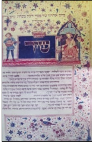
Illumination for the opening verse of Song of Songs, the Rothschild Mahzor, Manuscript on parchment. Florence, Italy, 1492. 2

One of the most powerfully erotic, celebratory, and secular love poems in all the world's literature, the Song of Songs (שיר השירים, or Shir ha-Shirim ) has endured nearly two thousand years of interpretation that attempts to tame it and explain it away. Traditionally dated to sometime around 950 BCE, the Song has a complicated textual history.