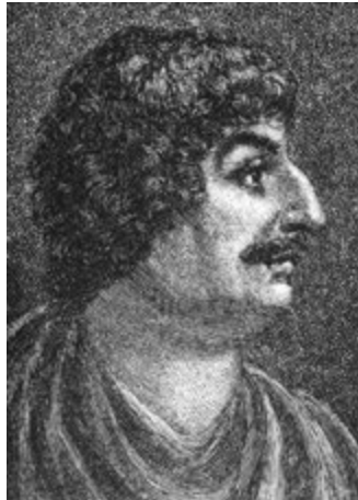
Robert Herrick, portrait by Edward Everett Hale, in The Hawthorne Readers , Book 4 (1904). 85

Though his name may not be as well-recognized as Donne's, there are probably more readers who recognize fragments of the poetry of Robert Herrick than almost any other English poet save Shakespeare.