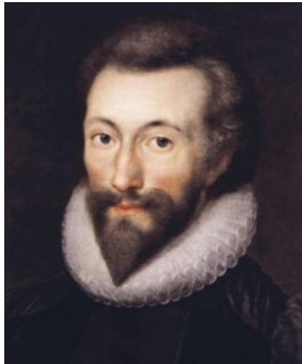
John Donne , portrait after Isaac Oliver (possibly late 17th century, based on a work of 1616). 11