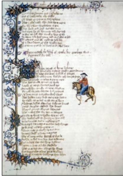
Opening page of the “Prologue of the Wife of Bath’s Tale”, from the Ellesmere manuscript of Geoffrey Chaucer’s Canterbury Tales (early fifteenth century). 221

To medieval readers, this pool of writing, which the Wife of Bath calls “auctoritee”, was not to be questioned lightly, though the challenging spirit of Wycliffe and the so-called Lollards can already be seen in Richard II’s rejection of the petition of the Commons in 1391 which sought to restrict education to the nobility, “that no neif or villein shall henceforth put his children to school in order to advance them”. 222 This was part of a movement that by 1406 resulted in the Statute of Education in which “Parliament declared that ‘every man or woman, of what state or condition that he be, shall be free to set their son or daughter to take learning at any school that pleaseth them within the realm’ [...] a triumph for Wyclifism”. 223 Though formal education had formerly been considered strictly a matter of men teaching authoritative men’s thoughts and glosses to other men, things were slowly changing.