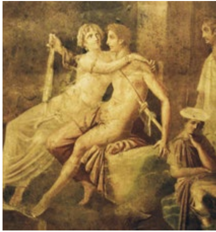
Dido and Aeneas. Ancient Roman fresco (10 BC–45 AC). Pompeii, Italy. 120

The love story between the two is mostly one-sided, primarily on Dido's part. The deck is strangely stacked against her, as well. She falls in love unwillingly, forced by the gods to play the role that will destroy her, despite the fact that Juno regards Dido as dying an undeserved death. The gods—as is their usual course in Homer, Virgil, and most Greek and Roman mythology—play with human beings like chess pieces on a grand game board. Dido's passion comes over her against her will as part of an ongoing struggle between Juno and Venus that dates all the way back to the famous judgment of Paris, that Venus was more beautiful than Juno. Dido is not a tragic figure in the later Senecan model, whose wounds are often self-inflicted. No, Dido, like so many tragic figures from the earlier Greek tradition of Aeschylus, Sophocles, and Euripides, is made a victim by the gods as they play out their petty rivalries on the human stage, with mortals as their unwitting proxies. Dido is caught, as Hamlet would say, between “the pass and fell incensed points / Of mighty opposites”: 121 Juno, who opposed Troy and opposes the founding of Rome, and Venus, who aids her son Aeneas wherever and whenever possible. Venus sends Cupid, in the guise of Aeneas' son, to pierce Dido's heart with the first fatal pangs of love for Aeneas: