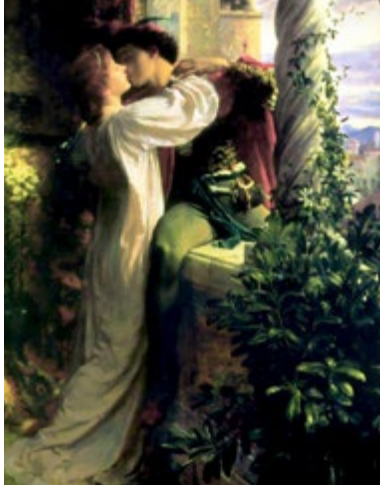
Frank Dicksee, Romeo and Juliet (1884). Southampton City Art Gallery. 142

When her initial willingness to cooperate changes into what seems to him an inexplicable and moody resistance, Capulet makes it clear what Juliet's position is: