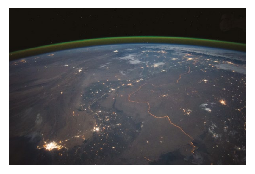
Fig. 2.2 India-Pakistan border at night (23 September 2015).<sup>47</sup>

In addition, landmines are laid along the fence as it runs from flat plains through mountainous forests. ^{46}