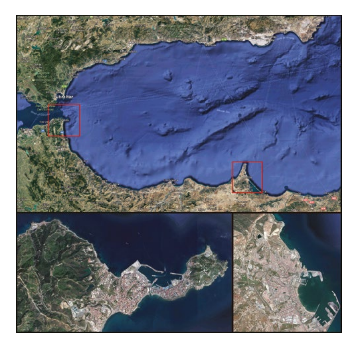
Fig. 3.1 Map of Ceuta and Melilla in Northern Morocco, three screenshots from Google Maps. © 2017 Google, all rights reserved.<sup>4</sup>

It gave £200 million for the construction of the razor-wire border fence around Ceuta, and it assumed 75 percent of the costs of the first project from 1995 to 2000.