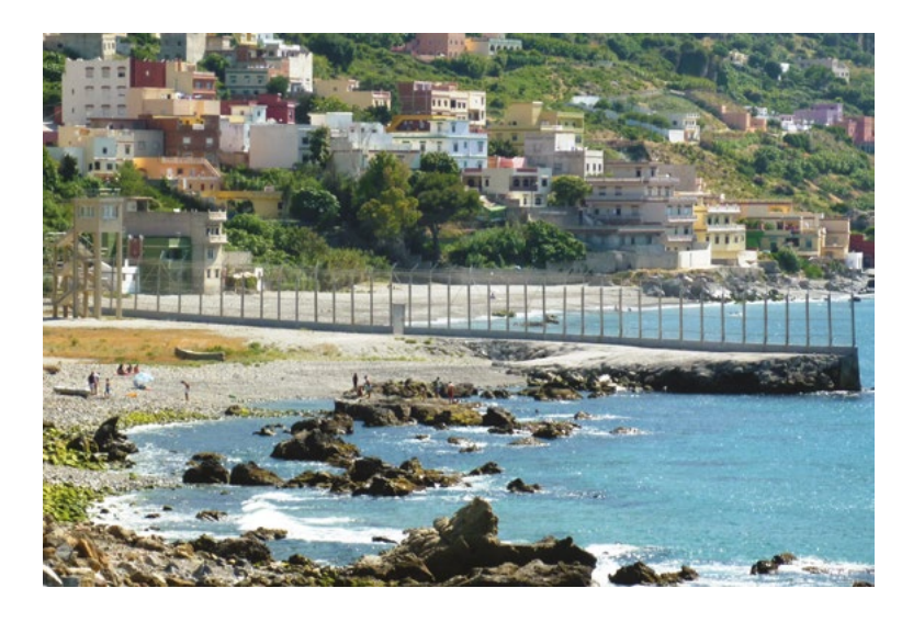
Fig. 3.3. Fence of Ceuta (15 June 2012).