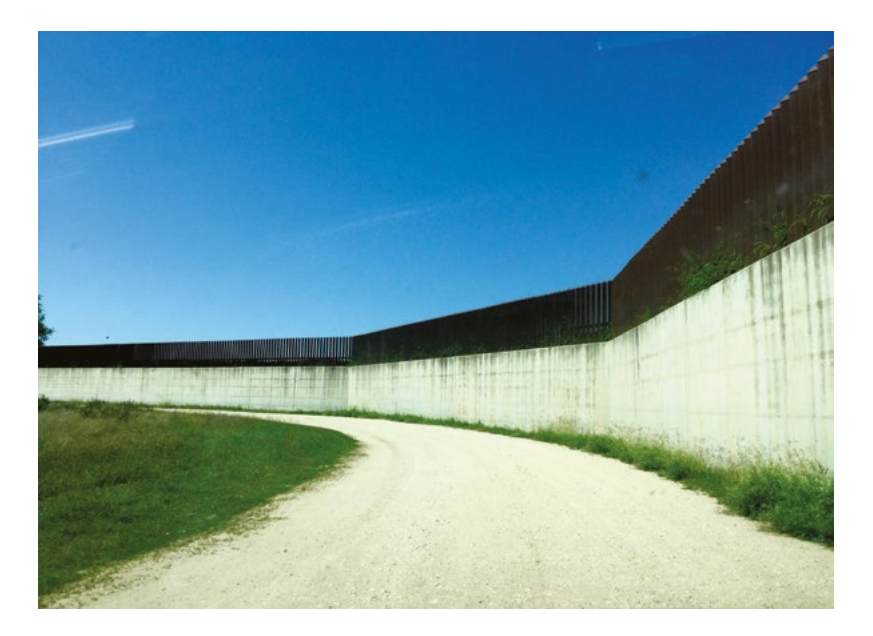
Fig. 4.2 South side of the United States-Mexico border wall in Progreso Lakes, Texas (21 March 2016). Photo by Rebajae, CC BY-SA 3.0.17

The financial cost of the project has increased year by year. Appropriations for the Homeland Security Department for fiscal year 2007 provided USD 1.2 billion for the installation of fencing, infrastructure and technology along the border; USD 31 million of this total was designated for the completion of the San Diego fence. Appropriations for fencing and other border barriers have increased markedly since the plan entered into force from USD 6 million in fiscal year 2002 to USD 647 million in fiscal year 2007. The fiscal year 2008 appropriation, according to Customs and Border Protection, included USD 196 million for fence construction. 16