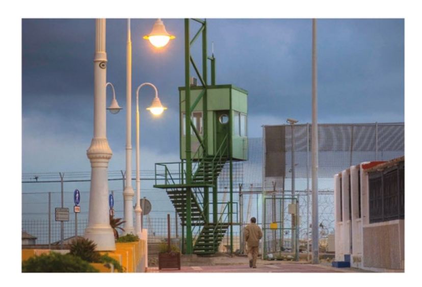
Fig. 3.2 Fence of Melilla (28 February 2009).