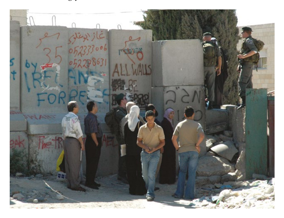
Fig. 1.2 A checkpoint in the West Bank Separation Wall, near Abu Dis (18 August 2004). Photo by Justin McIntosh, CC BY 2.0.30

Palestinian Muslims and Christians can no longer freely visit religious sites in Jerusalem. Permits are needed and are increasingly difficult to obtain.