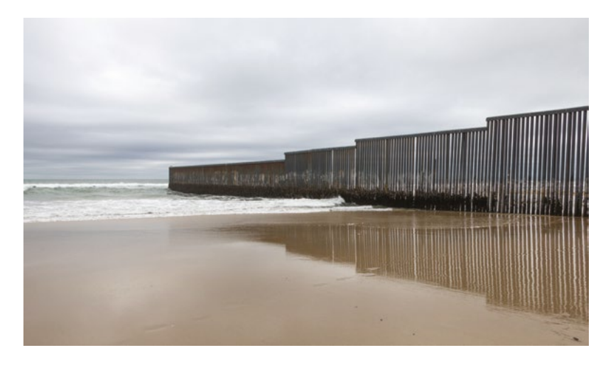
Fig. 4.1 U.S.-Mexico border fence at Tijuana (6 February 2017).<sup>11</sup>

before the 1990s, it started seriously building fences and escalating control measures along its borders with Mexico in 1994 under Clinton's administration, as a comprehensive policy. The border south of San Diego, which has been identified as an area of high human smuggling and drug trafficking, was the first borderland to be fenced. Republican representative Duncan Hunter, the former Chairman of the House Armed Services Committee, played a significant role in the construction of the first security fence (23 kilometers) on the U.S. southern border separating San Diego County and Tijuana (Mexico).