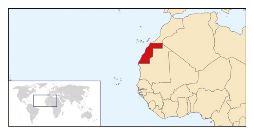
Fig. 5.1 Location of the Western Sahara. Map by Rei-artur, CC BY-SA 3.0.19

an entity different from Morocco in the region, Morocco had been most unwilling to do so again, if for no other reason than the simple fact that the colonial regimes involved were very different and reflected different colonial approaches rather than any inherent differences in the nature of the contiguous territories involved.<sup>18</sup>