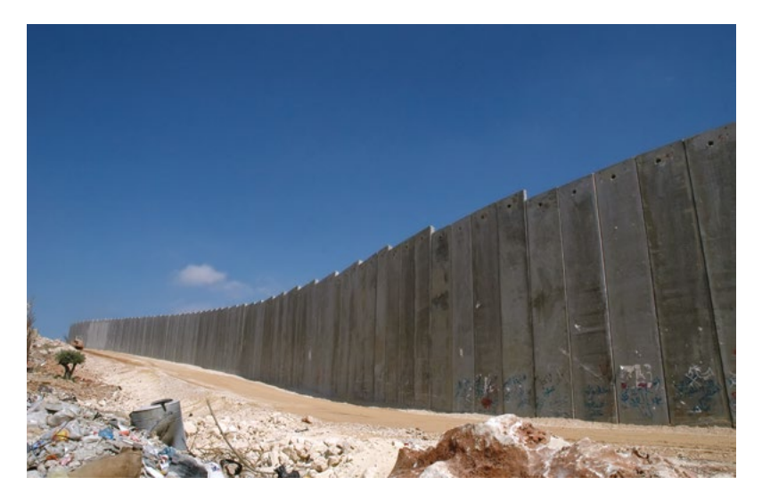
Fig. 1.1 The West Bank separation wall (17 August 2004).<sup>20</sup>

a "seam zone" and declared a "closed zone". According to the Israeli military Declaration of Closing an Area No. S/20/03 made on 2 October 2003, "no person will enter the seam area and no one will remain there". This order, however, does not apply to Israelis or those who have the right to immigrate to Israel according to the country's Law of Return.<sup>18</sup> The Palestinians who live near the area are allowed to remain in their homes and on their lands only if they possess a written permit authorizing permanent residence. It is expected that, when the separation wall is finished as planned, approximately 65,000 Palestinians will require permits to cross the wall into the West Bank where they legally reside, and some 270,000 Palestinians living in these areas will be trapped in closed military areas between the wall and the Green Line or in enclaves encircled by the wall.<sup>19</sup> That these confiscated lands in the "seam area" include the West Bank's most valuable agricultural land and water resources measuring 73,000 dunums, a vital source of income for the Palestinians in the region, is another cause of concern for a failing Palestinian economy.