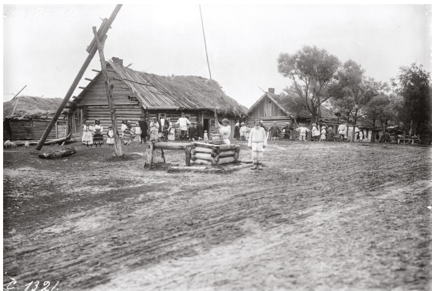
Fig. 3.6 A village. Russians, Kaluga guberniia. Photo by Nikolai M. Mogilanskii, 1903 (REM 758-12). © Russian Ethnographic Museum, St Petersburg