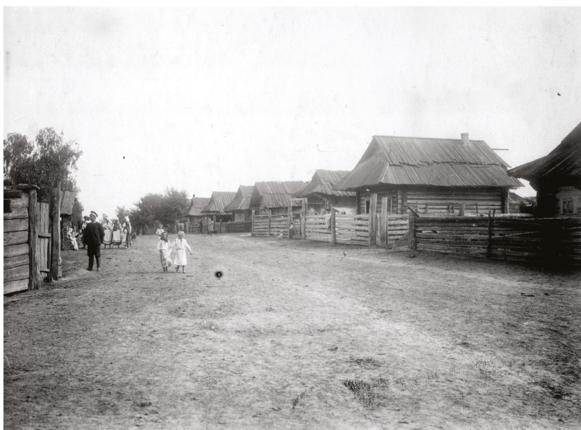
Fig. 3.10 "A street". Ukrainians of the Volynskaïa guberniâ. 1907. RĖM 3747-64.