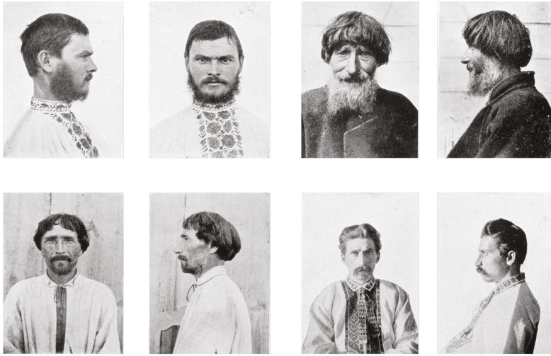
Fig. 3.11 “Types of the Ukrainian population: a) Psarovka, Chernigovskaia guberniia (slightly mongolised), b) Kroveletskii uезд, Chernigovskaia guberniia, c) Obruchskii uезд, Volynskaia guberniia, d) Pavlogradskii” (Volkov et al. 1914–1916: 400)

Mr Volkov constantly speaks about “ethnic” influences, “ethnic” admixtures etc., but the Greek word etnos — the people ( narod ) has to do with a spiritual essence of the people, and not with its bodily features. Ethnic influence can be felt in language, way of life ( byt ), folklore, customs, costume, ornaments etc., but not in the height, the length of legs or the shape of noses’ (Anuchin 1918: 54).