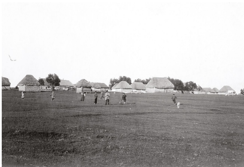
Fig. 3.7 A view of the sloboda (a quarter of a village) "Bugor". Russians, Tula guberniia. Photo by Nikolai M. Mogilanskii, 1902 (REM 757-2). © Russian Ethnographic Museum, St Petersburg