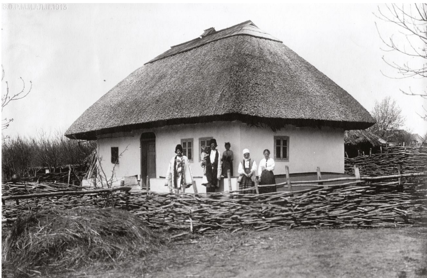
Fig. 3.8 An izba , covered with reeds. Ukrainians. Bessarabskaia guberniia. Photo by Nikolai M. Mogilianskiĭ, 1906 (REM 851-3). © Russian Ethnographic Museum, St Petersburg

A published fieldwork report contains the ethnographer's musings about the correlation between the planning of Great and Little Russian villages and the psychology of their dwellers. The southern Great Russian villages consisted of chaotically positioned houses without fences between them, while in Mogilianskiĭ's native Chernigov province "each farm is a self-contained whole, fenced off from all sides and accessible for the eyes of only [its] closest neighbours" (Mogilianskiĭ 1910: 3) (Fig. 3.8). Thus, he muses, the public nature of life in the Great Russian village naturally accustoms dwellers to collectivism, while the planning of Ukrainian villages itself conveys the idea of individualism (Fig. 3.9, 3.10).