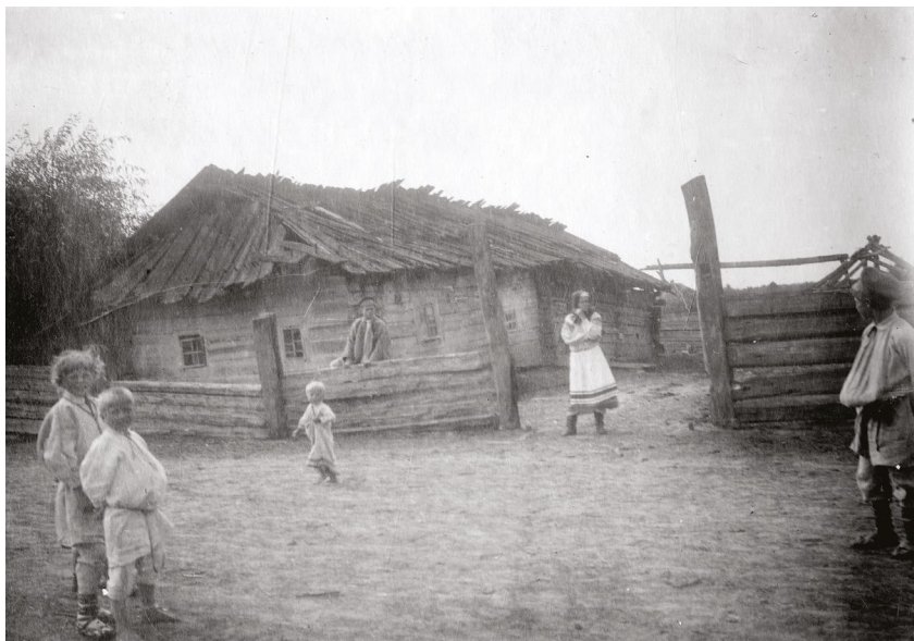
Fig. 3.9 "A khata". Ukrainians of the Volynskaïa guberniâ. Photo by Fëdor K. Volkov, 1907 (RĖM 3747-43). © Russian Ethnographic Museum, St Petersburg