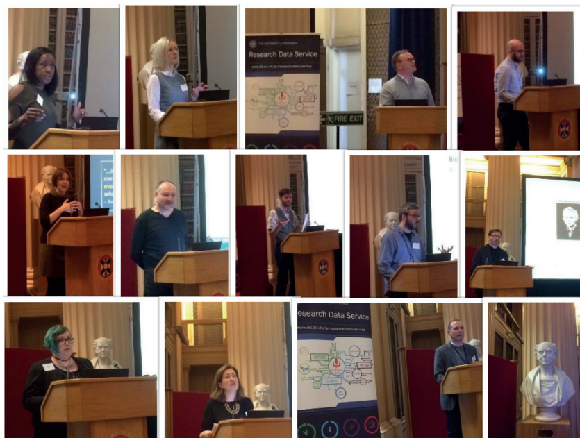
Fig. 4.1 A collage from the 'Dealing with Data' conference 2018 by Robin Rice.