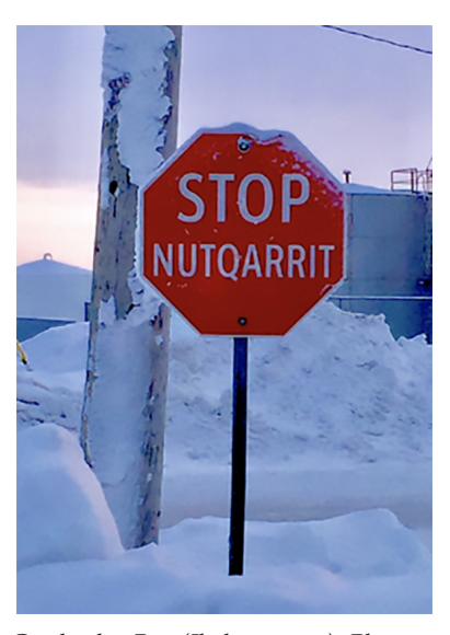
Fig. 10 Stop sign in Cambridge Bay (Ikalutuuttiaq). Photograph by Hart Cohen, 2019.

In a modest manner, we believe the projects found in this chapter emulate this call to commitment and action.