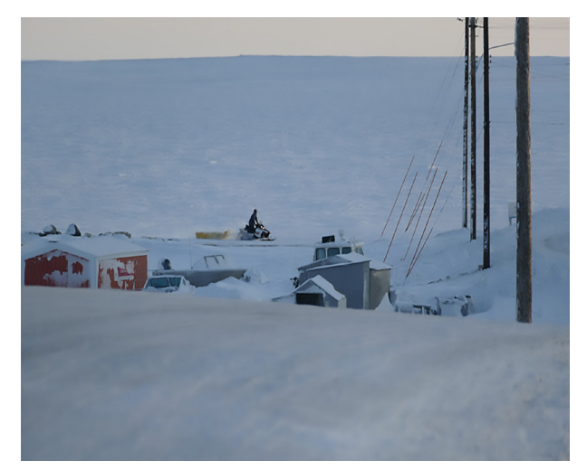
Fig. 9 Arctic Ocean from Cambridge Bay (Ikalutuuttiaq), Western High Arctic. Photograph by Hart Cohen, 2019.

Having recently visited the western High Arctic, the sense of it as a 'barometer' of climate change is due to its vulnerability to environmental change.<sup>69</sup> This features in the context of the discourses of both research institutions and so-called 'non-state actors', and is linked to the Anthropocene. Rapidly melting sea ice, as well as other impacts of climate change, have been documented in a report on recently completed comprehensive studies.<sup>70</sup> The results have led to the emergence of multiple sources such as non-state actors, NGOs, and research organizations (e.g., Canadian High Arctic Research Station or CHARS) as significant influences in understanding and informing policy relating to the complex issues of climate change.