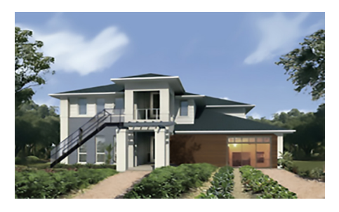
Fig. 3 A future imagined: a 'McMansion' becomes a co-housing retrofit and hot tarmac is de-paved to make way for food gardens. Image credit: Jonathon Allen/ Paul Kouppas, FuturesWest 2031, 2009.<sup>13</sup>

ahead of its time. The event was, however, a significant learning exercise for everyone involved, and provided an experience of the university in the role of facilitator of social learning for sustainability, and as a hub for facilitating sustainability transitions.<sup>14</sup>