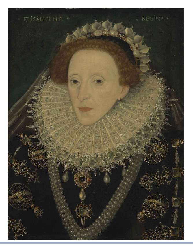
Elizabeth I of England, ca. 1580, oil on panel. English School.