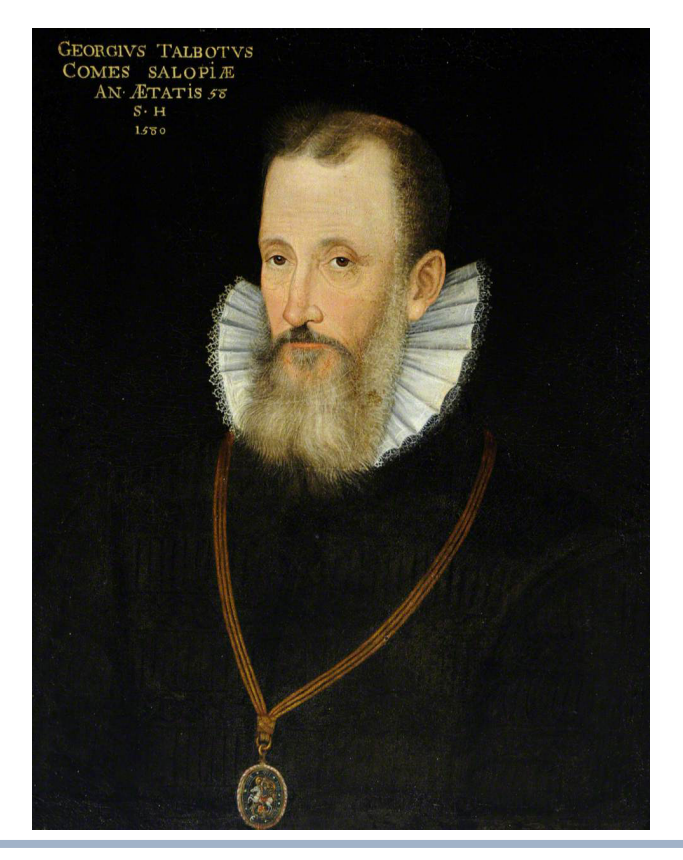
George Talbot, 6<sup>th</sup> Earl of Shrewsbury, 1580. Artist unknown. National Portrait Gallery, London.