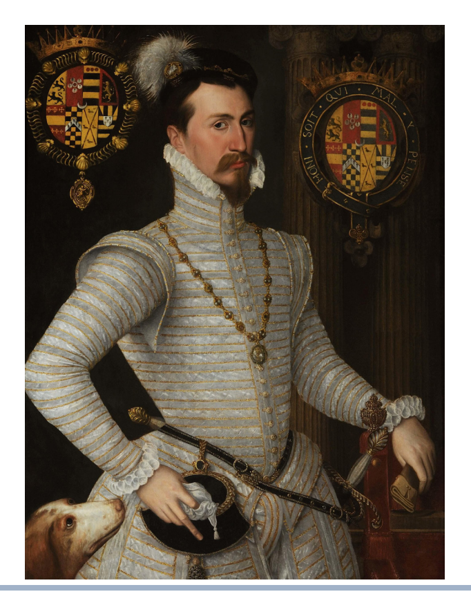
Robert Dudley, Earl of Leicester, ca. 1564, oil on panel. Anglo-Netherlandish School. Waddesdon Manor.