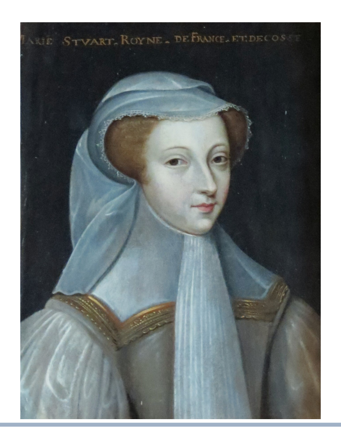
Tableau représentant Marie Stuart, reine de France et d'Écosse. Château de Blois.