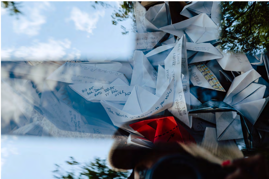
Fig. 3 Location: Battery Park City, Belvedere Plaza, NYC.