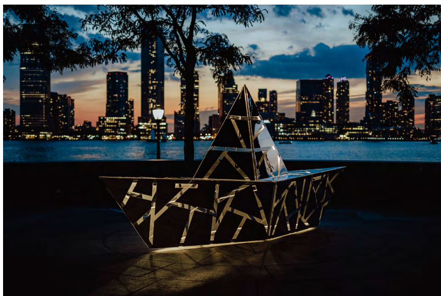
Fig. 4 Location: Battery Park City, Belvedere Plaza, NYC. Photo courtesy of the artist © Muna Malik.