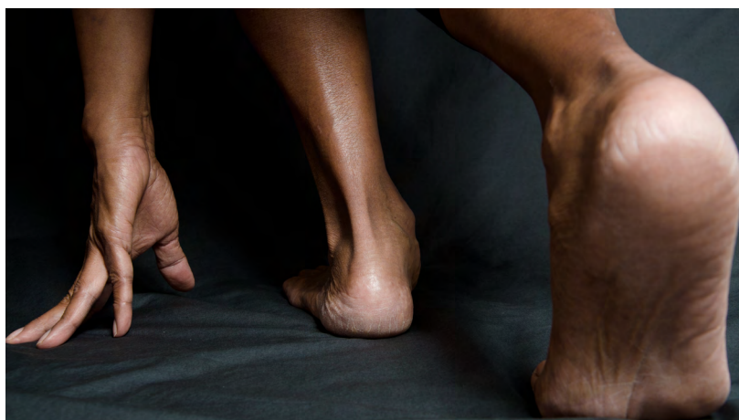
Fig. 10 #blackmoves, Giclée photographic prints, 80x45cm, 2020.