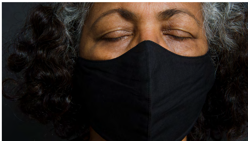
Fig. 7 #racismisapandemic, Giclée photographic prints, 80x45cm, 2020.