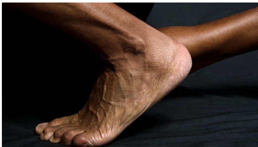
Fig. 8 #TakeAKnee, Giclée photographic prints, 80x45cm, 2020.