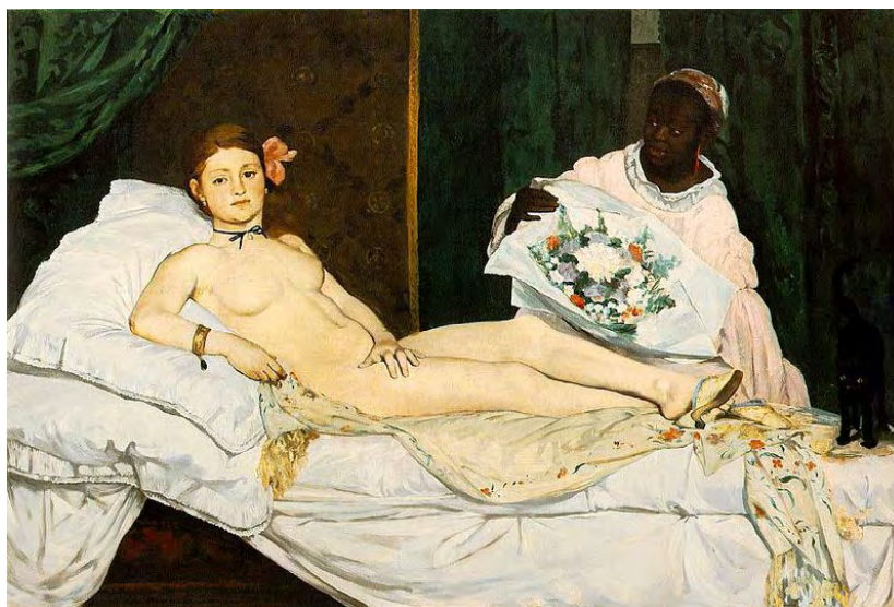
Fig. 2: Édouard Manet, Olympia (1863), Public Domain, Wikimedia, https://commons.wikimedia.org/wiki/File:Manet,_Edouard_-_Olympia,_1863.jpg .

focused on how the world appeared to them at a certain moment in time. Accordingly, they challenged the contemporary convention of the naturalistic portrayal of perspective, flora and fauna, and the human body, a tradition stemming from the Renaissance, and paved the way for a completely new concept of art dominated by personal perceptions and emotions, that is to say, by subjectivism above all. Nonetheless, impressionists remained faithful to the observable life-world by focusing on nature and the built environment.