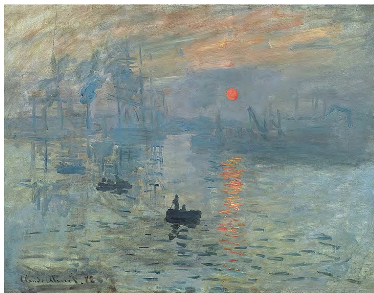
Fig. 3: Claude Monet, Impression, Sunrise (1872), Public Domain, Wikimedia, https://commons.wikimedia.org/wiki/File:Claude_Monet,_Impression,_soleil_levant.jpg .