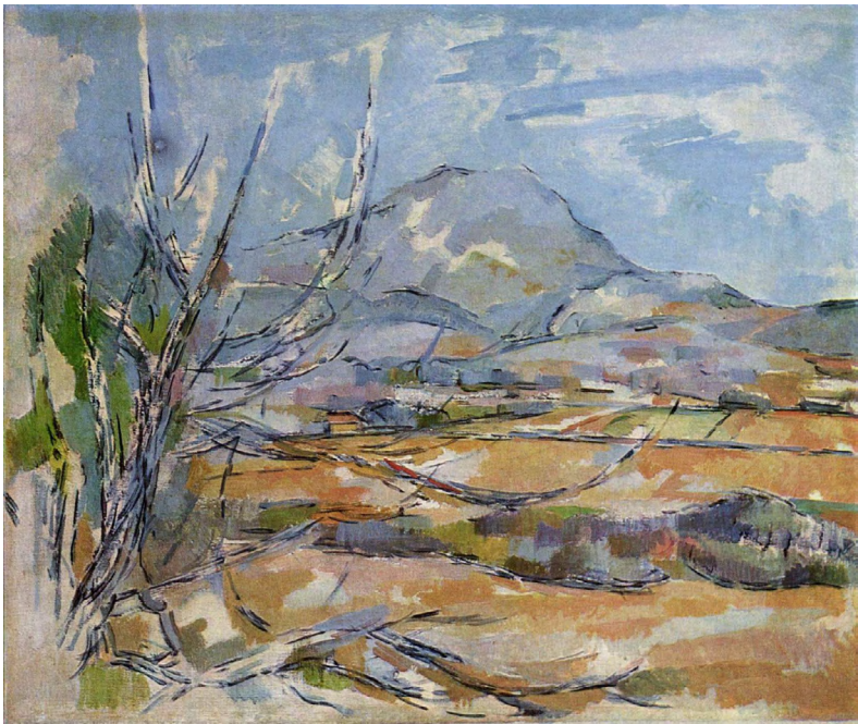
Fig. 4: Paul Cézanne, Mont Sainte-Victoire (between 1885 and 1887), Public Domain, Wikimedia, https://commons.wikimedia.org/wiki/File:Montagne_Sainte-Victoire,_par_Paul_C%C3%A9zanne_106.jpg .